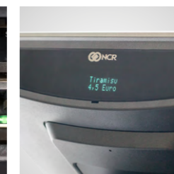
Elegantly integrated 2x20 character customer display (optional)