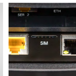
Direct connection of Orderman radio without power supply unit (PoE) (optional)