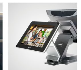
Customer displays in various designs (optional)